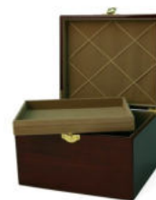
Memory chest for ashes as well as items such as pet collar and photos