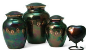
Traditional urns in a variety of sizes, shapes and materials