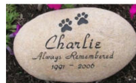
Engraved marker urns suitable for garden placement