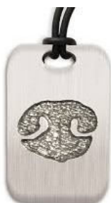
Nose and/or paw print Jewelry and various mementoes