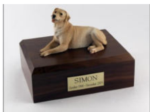
Figurine urn, dog or cat

A sampling of our urns, keepsakes, jewelry and markers