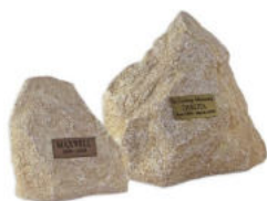
Rock marker urns with plaque