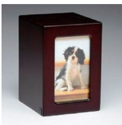
Photo urns in various finishes